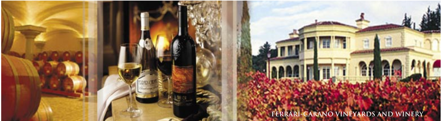
FERRARI-CARANO VINEYARDS AND WINERY

“While you visit wine country, we hope that you have the opportunity to visit us at Ferrari-Carano Vineyards and Winery. The beautiful gardens and wonderful wines will be a memorable part of your wine country visit.”